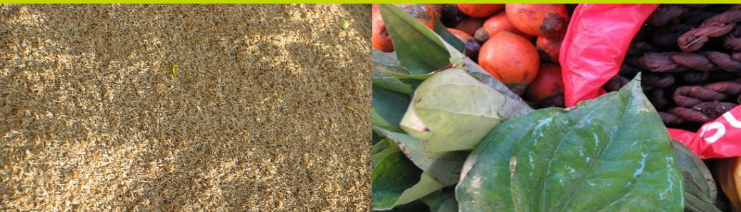
the wasteland shrub Prosopis Juliflora, rice husks from the paddy fields