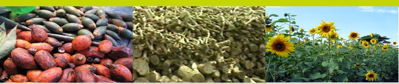
Typical waste reused as Biomass fuel—Betel nut husks, the tops and lops of the eucalyptus tree, sunflower stalks,