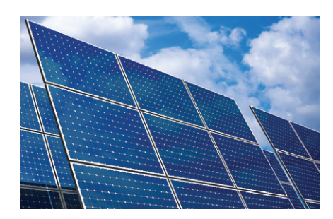
Discover EPower controller